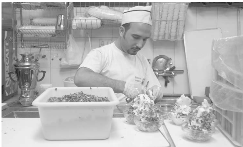
Making sundaes at Bakdash Ice-cream Parlor in Damascus, Syria.